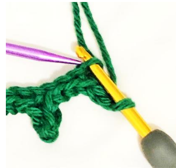
The knitting needle points to the bottom loop of the last sc made.

“Sl St into the bottom loop of the last sc made...” :