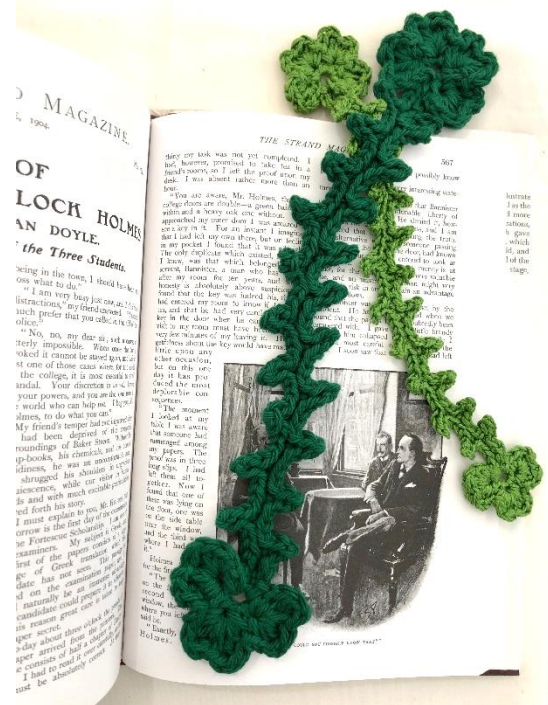
The left bookmark in the photo above was constructed with Peaches and Cream cotton in the Forest Green colorway and a 4.5 mm hook. While the bookmark on the right was made using DMC Petra #5 mercerized cotton, color 5905, (held double) and a 3.25 mm hook.

Give the gift of hope, faith, love, and luck to a special book lover!